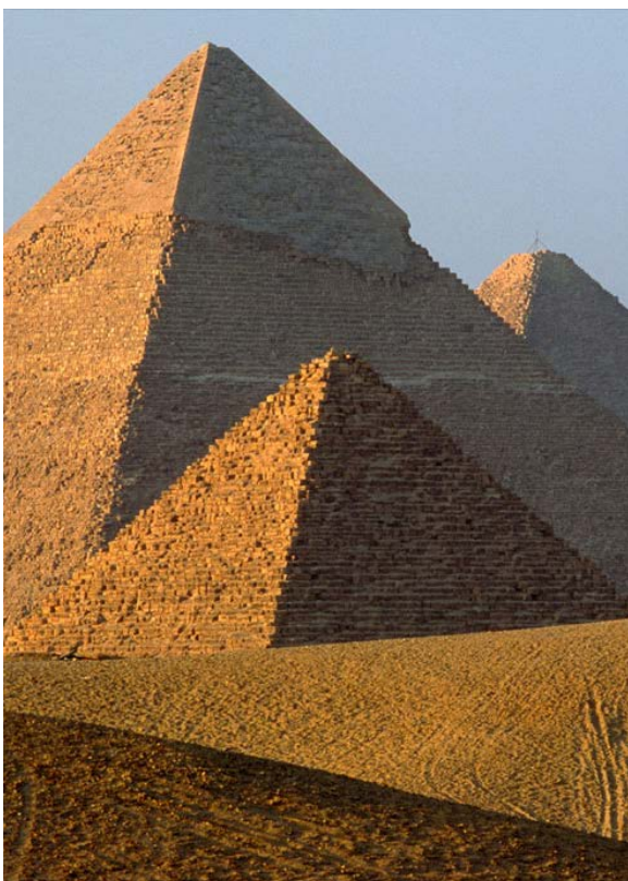
The Ancient Pyramids (Giza, Egypt)