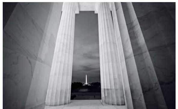
Washington Monument from the Lincoln Memorial