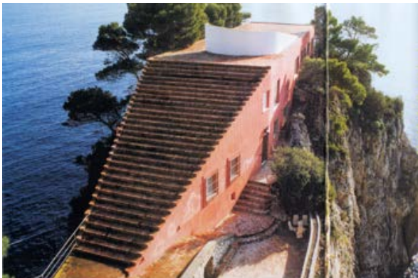
Casa Malaparte, Italy (Adalberto Libera)