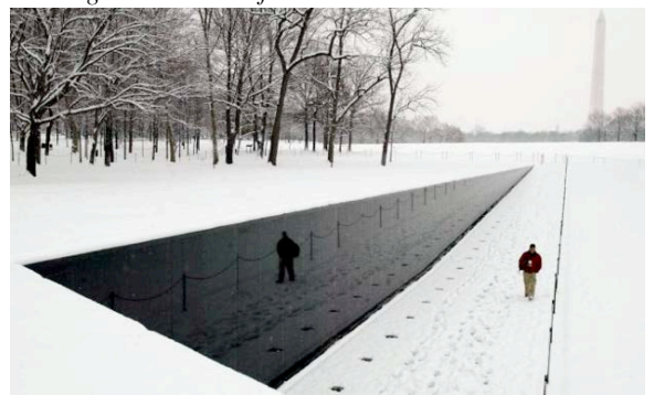
Vietnam Memorial (Maya Lin)